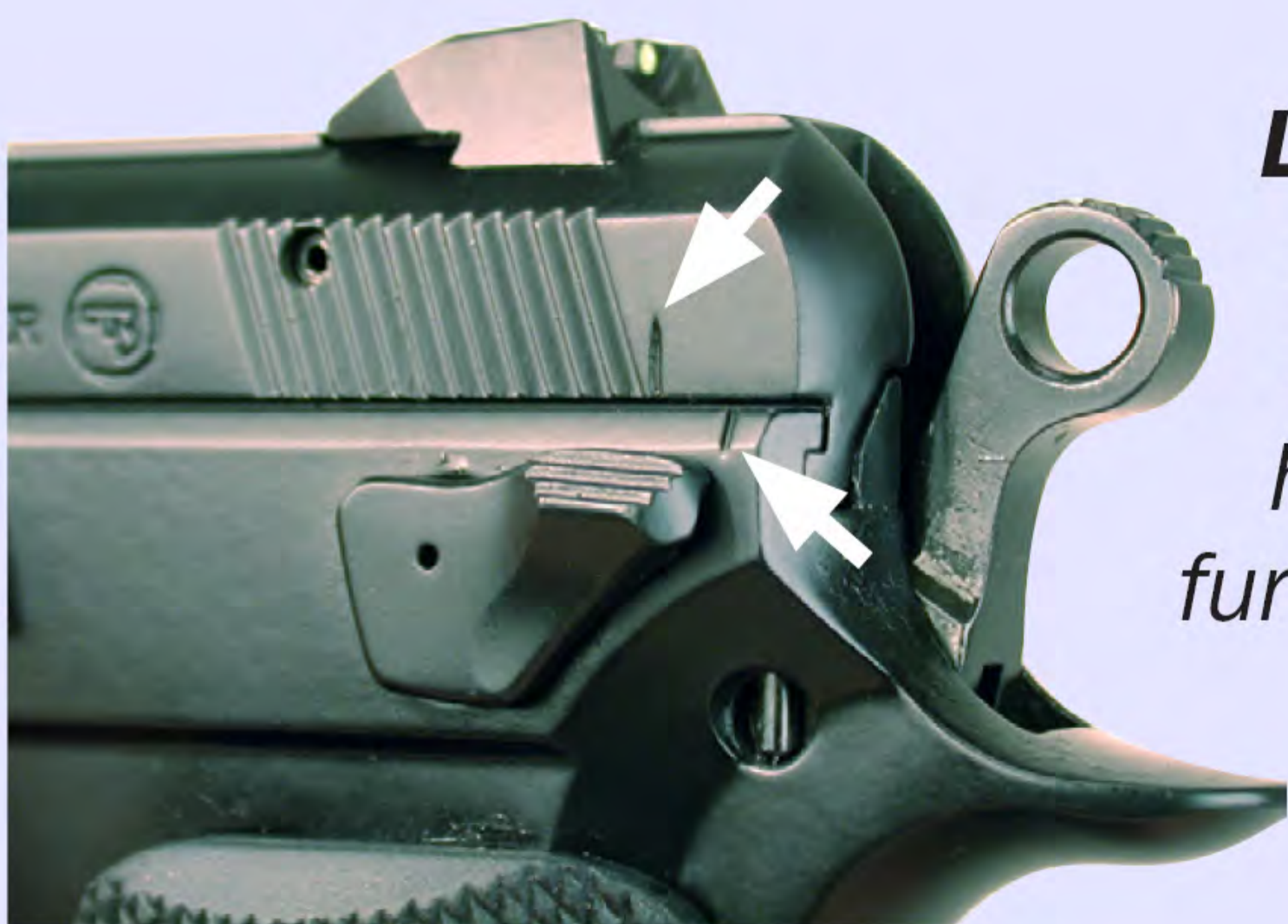
Left: After using the left-side-only decocker, we felt the hammer stayed much further back than other traditional double-action pistols. This shortened trigger reach and decreased the

time required to fire the first shot double action. The two vertical lines on the frame and slide are for alignment during takedown.