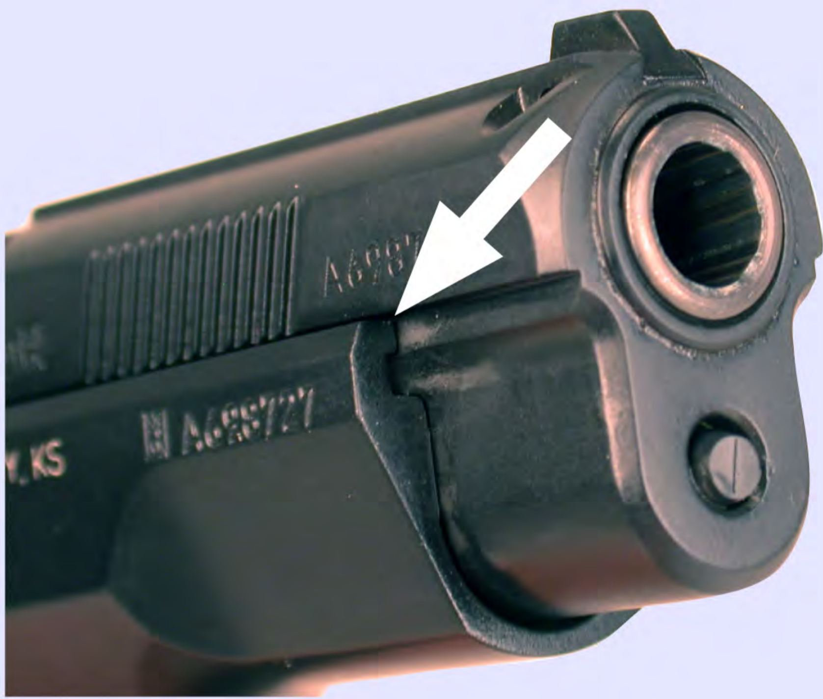
Left: Unlike most semi-automatic pistols, the CZ frame rails fit over the slide.