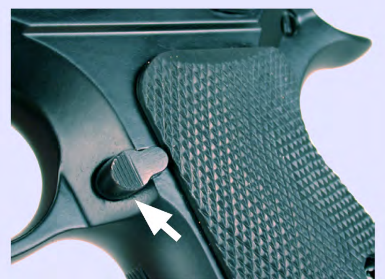
Right: The full-texture rubber grips are not new, but we liked them anyway. The stylish high-profile magazine release was a welcome addition.

time required to fire the first shot double action. The two vertical lines on the frame and slide are for alignment during takedown.