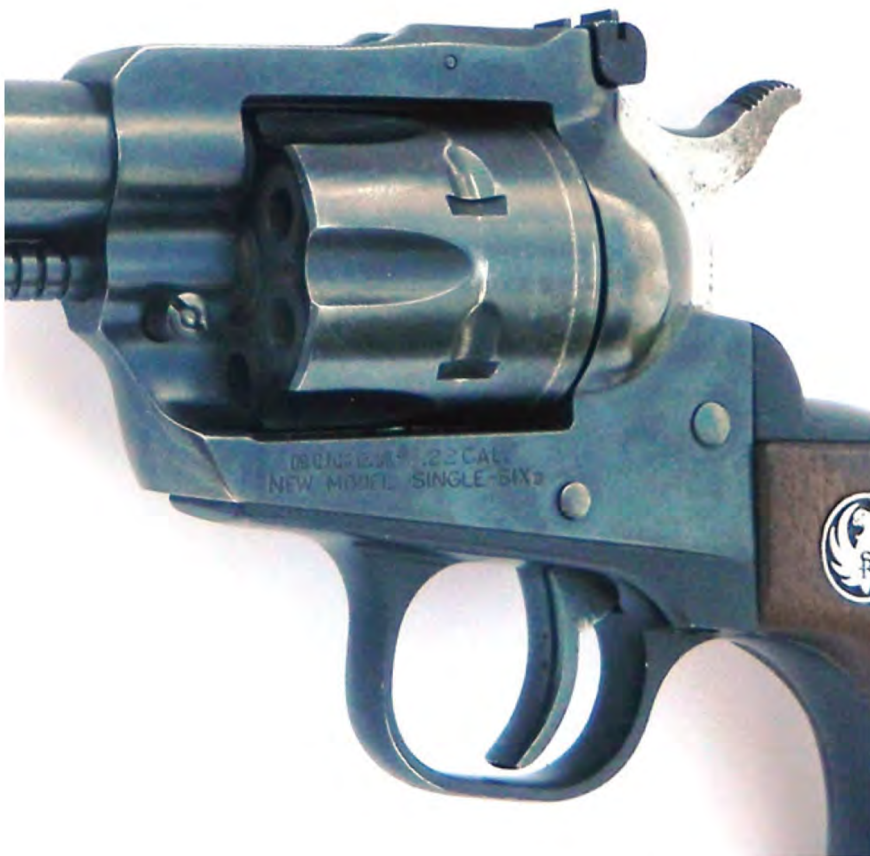
Above: The Ruger was introduced in 1953. Though it has undergone various refinements, the modern Ruger would be recognizable to anyone who purchasing the Single Six 22 58 years ago. The 7/8-size single action was not a straight-up copy of the Colt, but rather featured significant improvements, including rugged construction and coil wire springs rather than flat springs.